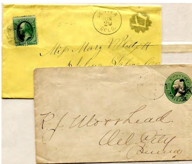
Denver, Colorado & Northeast, Pennsylvania