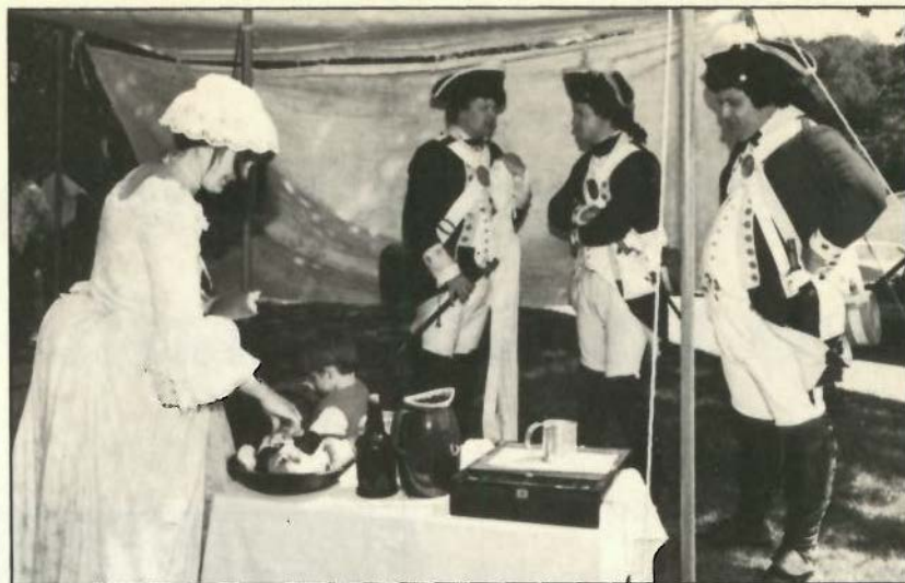
Representatives of the Sudbury militia (top left) and His Majesty's First Battalion of the Royal Marines (top right) add color to the festivities.