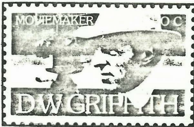
D. W. Griffith, motion picture pioneer who was widely acclaimed for his cinematographic innovations, will be honored on a U.S. commemorative to be issued later this year.

The U.S. Postal Service will release a 10-cent commemorative stamp honoring motion picture pioneer David W. Griffith, the man credited with freeing the motion picture from stage conventions and who gave flexibility to the camera.