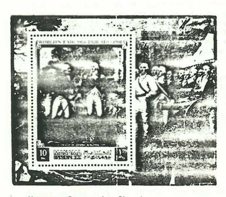
Manama Souvenir Sheet

The American Revolution Bicentennial Commission (ARBC) has invited foreign governments to participate in the 200th anniversary of the United States by issuing special commemoratives illustrating the ideals of the American Revolution "which it holds in common with us or illustrating the significance of the history of the United States to its own national experience." The ARBC points out that the United States was due to the "talent and people of many nations," and that in recent times such a precedent was established on several occasions; the most notable being the international commemoration of the first manned landing or the moon.