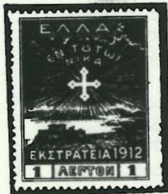
Greece Scott No. N150

The Order of the Red Cross of Constantine was established by Constantine the Great, first Christian Emperor of Rome and most powerful monarch of his time, after the Battle of Saxa Rubra, 312 A.D. Constantine and his army were said to have seen a flaming cross in the sky at noonday and in Grecian letters the inscribed words, "By This Sign Conquer." That night Constantine was again visited with a vision of Christ displaying the same celestial cross and directing him to frame a similar standard and march against his enemies.