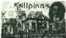
Emilio Aguinaldo and Historical Building, Cavite

On April 19, 1901 he took an oath of allegiance to the U.S. and retired to a peaceful life. During the Spanish rebellion he organized the Triagle Magdalo, with other Freemasons and it later became Magdalo Lodge. The lodge held its meetings in Aguinaldo's residence. It was on the balcony of this residence that the proclamation of the First Republic and the unveiling of the original Philippine flag took place, June, June 12, 1898. Four months after his initiation into Freemasonry, he affiliated with the Katipunan, an organization patterned after Freemasonry with passwords and three degrees. Seeing this organization was the best means of gathering support for the revolutionary movement, he encouraged all able-bodied men to join it, and the success of the revolution, at least in Cavite, may be attributed to the Katipunan. When the Grand Orient of Spain fused with the G.L. of the Philippines in February 1917, Aguinaldo became a Scottish Rite Mason. He was coroneted a 33° on Feb. 13, 1955. d. 1964.